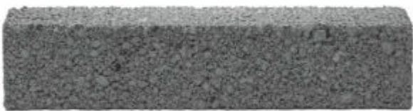
Fibo 850/950 Coursing Block - Front View

Coursing Blocks compliment the use of standard size blocks. They can be used as infill as well as general coursing and their use will remove the need for on-site cutting, which reduces waste and improves productivity. Their use will enable a uniform performance to be achieved throughout a wall.