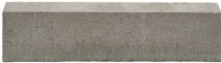
Lignacite GP Coursing Block - Front View

Coursing Blocks compliment the use of standard size blocks. They can be used as infill as well as general coursing and their use will remove the need for on-site cutting, which reduces waste and improves productivity.